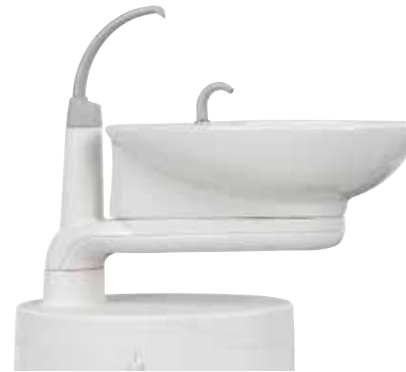
Rotating vitreous china cuspidor