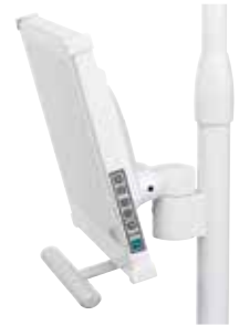
Light monitor mount