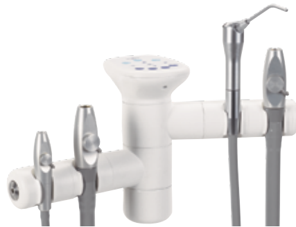
Dual 2-position holder