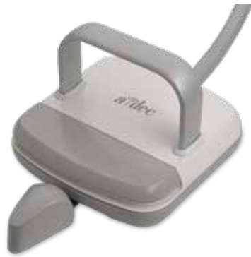
Lever foot control