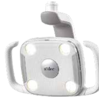
A-dec 300 LED