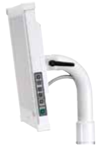
Radius monitor mount