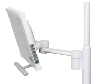
Light monitor mount with link arm