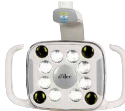
A-dec 500 LED