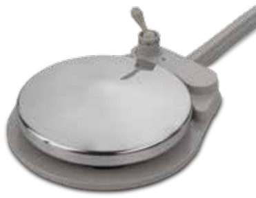
Disc foot control