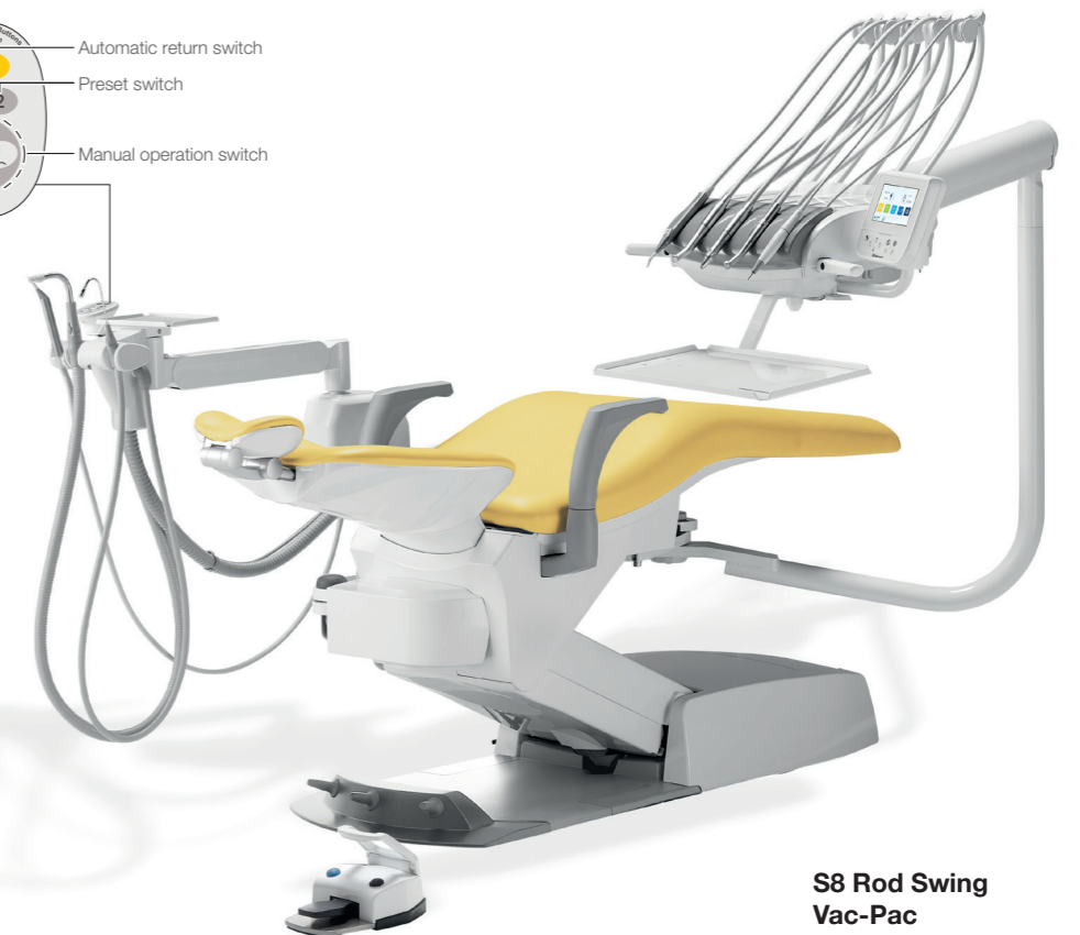
S8 Rod Swing Vac-Pac