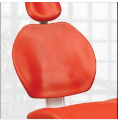
Formed upholstery without armrests