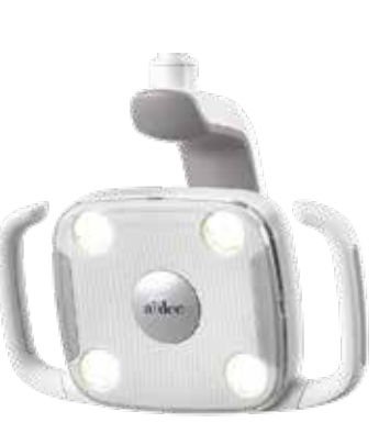
A-dec 300 LED

Place the assistant's clinical devices right where they are needed most. Adjustable 3- or 4-position holders are available as a chair mount, cuspidor mount or telescoping arm.