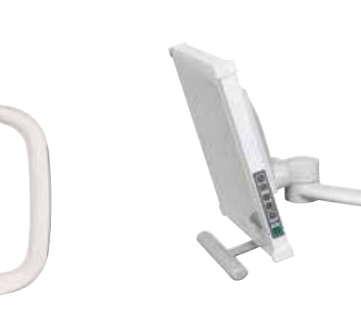
Light post monitor mount with link arm