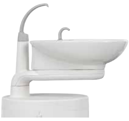
Rotating vitreous china cuspidor