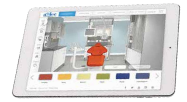
Order Your Samples at a-dec.com/InspireMe

Actual colors may vary. See your authorized A-dec Dealer for color samples and the most current product information.