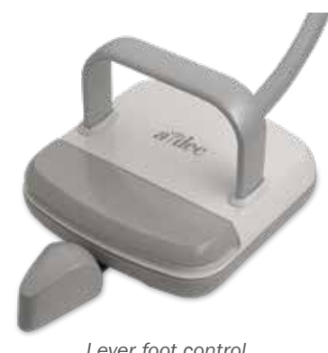
Lever foot control

Fingertip access simplifies chair adjustments and provides quick access to dental light and cuspidor control. Optional deluxe touchpad adds controls for integrated clinical devices such electric motors, cameras, and scalers.