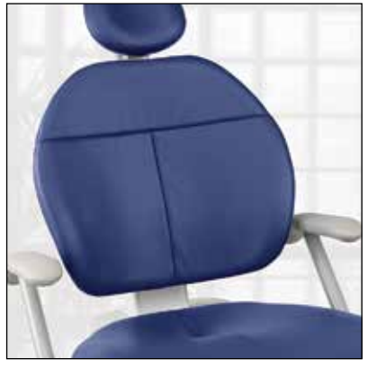
Sewn upholstery with armrests