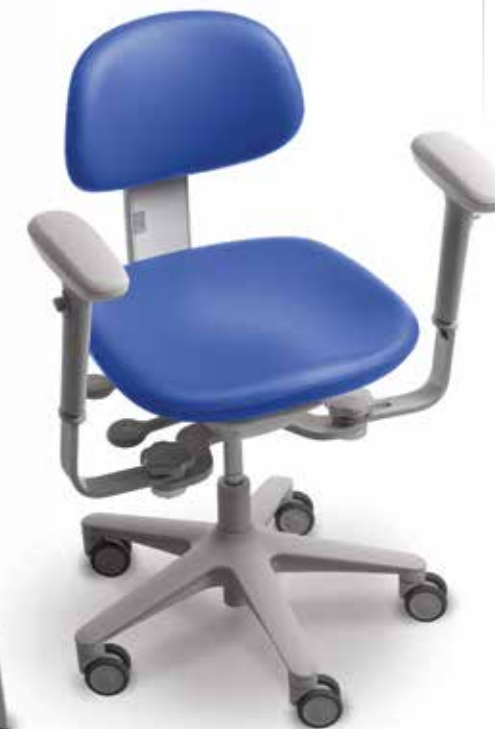
A-dec 521 Doctor's Stool with Optional Swing-out Armrests

Replaces foot ring to better distribute weight from the seat to the feet for an "athletic stance."