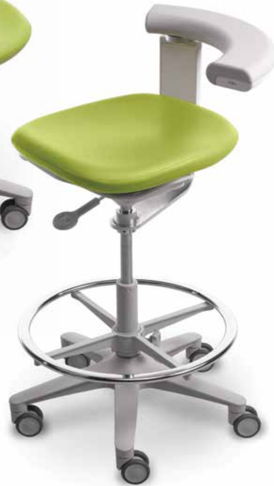
A-dec 522 Assistant's Stool