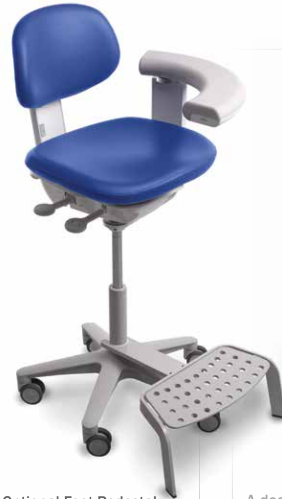
A-dec 522 Assistant's Stool with Optional Foot Pedestal and Backrest