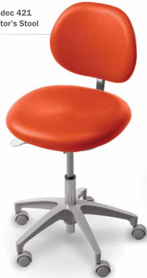
A-dec 421 Doctor's Stool