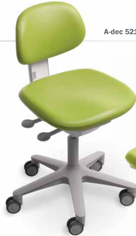
A-dec 521 Doctor's Stool

A push button makes access and one handed adjustments easy.